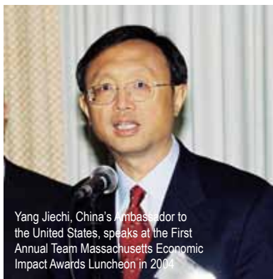
Yang Jiechi, China's Ambassador to the United States, speaks at the First Annual Team Massachusetts Economic Impact Awards Luncheon in 2004

1994 Launches the statewide Site Finder Service