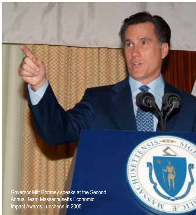
Governor Mitt Romney speaks at the Second Annual Team Massachusetts Economic Impact Awards Luncheon in 2005

2001 Convenes the First Statewide Regions and Industry Clusters Forum , a conference opened by the Governor, and which provides a framework for keeping expanding business in Massachusetts