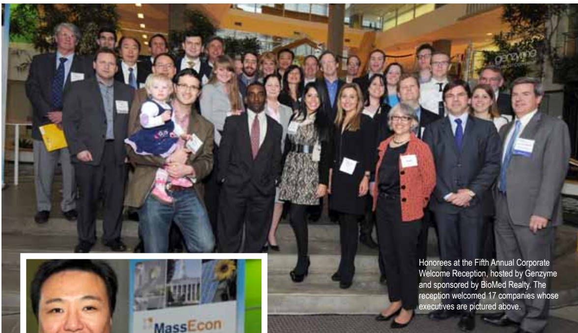
Honorees at the Fifth Annual Corporate Welcome Reception, hosted by Genzyme and sponsored by BioMed Realty. The reception welcomed 17 companies whose executives are pictured above.

BTI Systems | CitySprout | Copa Airlines | Cureport | Desalitech | EnergySavvy | Janji | Johnson & Johnson MarketMeSuite | Nipendo | PayPal | Rhode Island Novelty Company | Sequence, Inc. & PCI LLC | Sialex Sony DADC | Xenetic Biosciences | Zappix