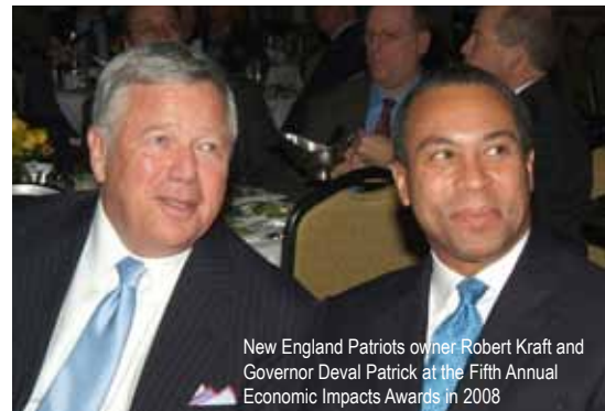
New England Patriots owner Robert Kraft and Governor Deval Patrick at the Fifth Annual Economic Impacts Awards in 2008

1996 Publishes the first Massachusetts Industrial and Research Park Directory in joint venture with NAIOP