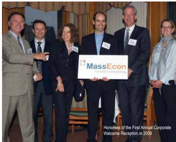
Honorees of the First Annual Corporate Welcome Reception in 2009

2004 Hosts the First Annual Team Massachusetts Economic Impact Awards event in Massachusetts