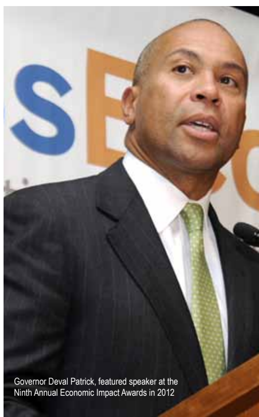
Governor Deval Patrick, featured speaker at the Ninth Annual Economic Impact Awards in 2012

2011 Appointed to serve on the Massachusetts Marketing Partnership Board